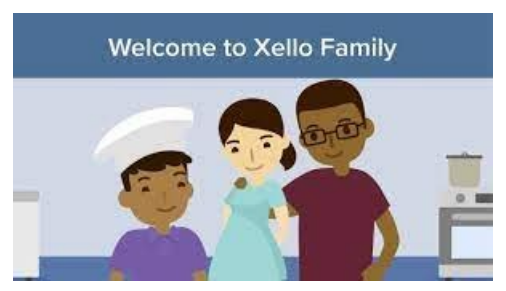
Click on the image above to check out a short video for an overview of key features and how to get around your Xello Family account.

Select a grade and start exploring. Use this opportunity to experience firsthand what your child is working on in school. Try a Lesson, complete an assessment, or explore careers!